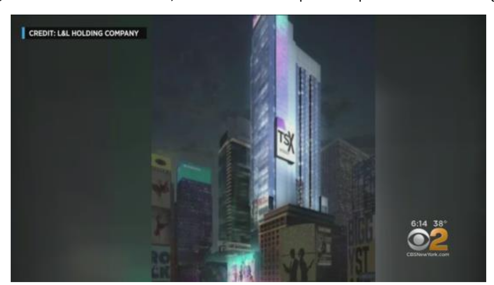
TSX Broadway

Located at the corner of 47th Street and Seventh Avenue, it will be called "TSX Broadway." The plan is to take over the DoubleTree hotel, refurbish the Palace Theater, and then raise it all up above a part of the new building.