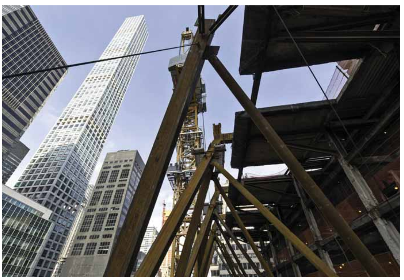
Construction at 425 Park Avenue in May of 2017.