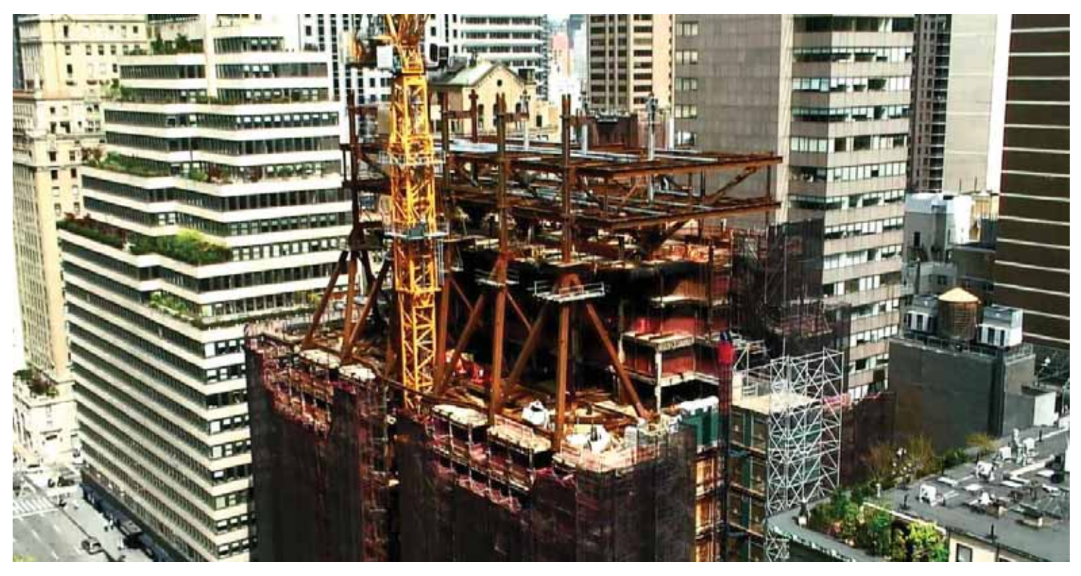
Construction at 425 Park Avenue in May of 2017.

British architect Lord Norman Foster's Foster + Partners has designed what will read as an essentially new office building, rising 725 feet to the roof and 893 feet to the architectural top. It will span 47 stories and 670,000 square feet.