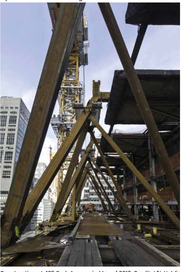
Construction at 425 Park Avenue in May of 2017.