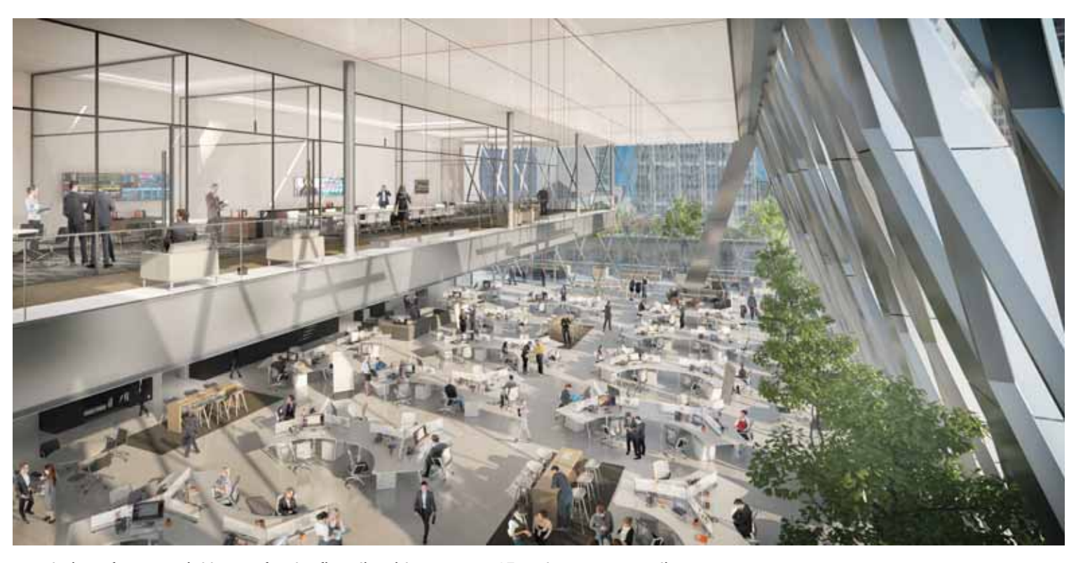
Rendering of a potential layout for the first diagrid space at 425 Park Avenue. Credit: Tangram.