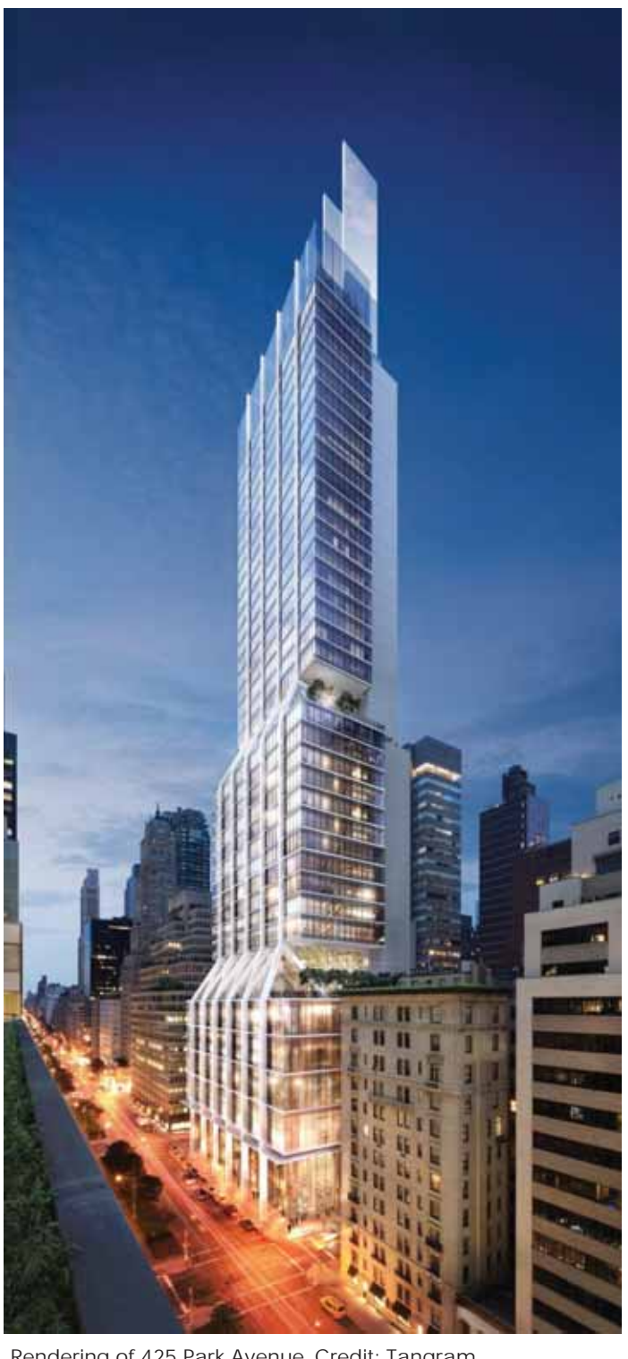
Rendering of 425 Park Avenue.