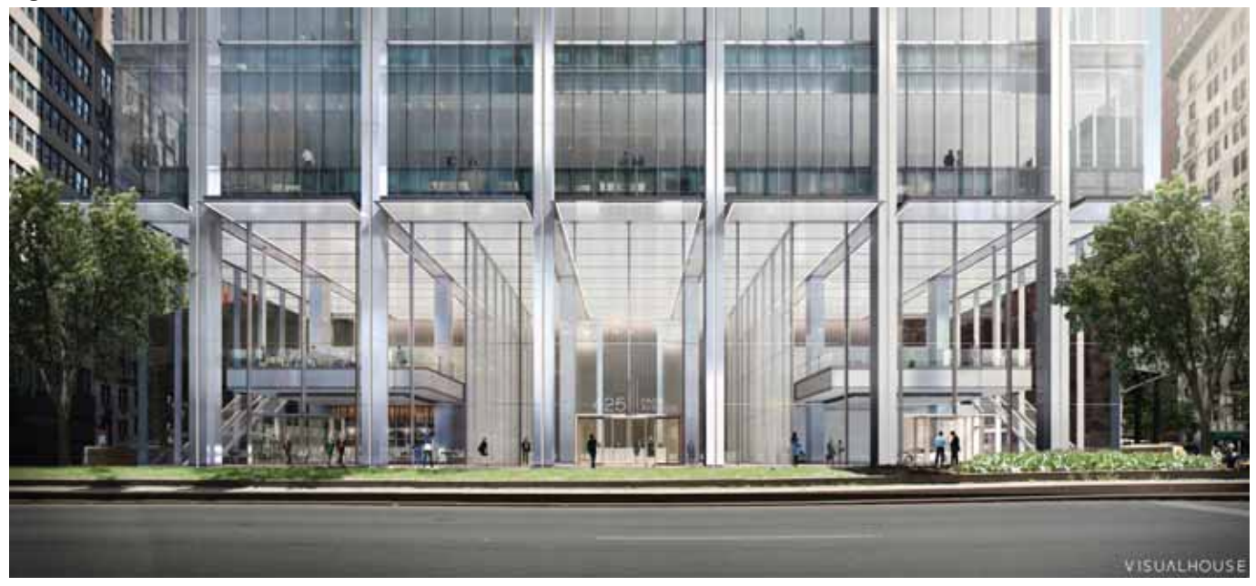
Rendering of 425 Park Avenue.

Now, work is underway by L&L Holding to redevelop the site, partnered with GreenOak Real Estate Advisors and Tokyu Land Corporation. Due to a quirk in city zoning, if the developer chose to demolish the entire original building, something smaller would have to be built in its place. However, by maintaining 25 percent of the original structure, the development team can go bigger — and that's exactly what they're doing.