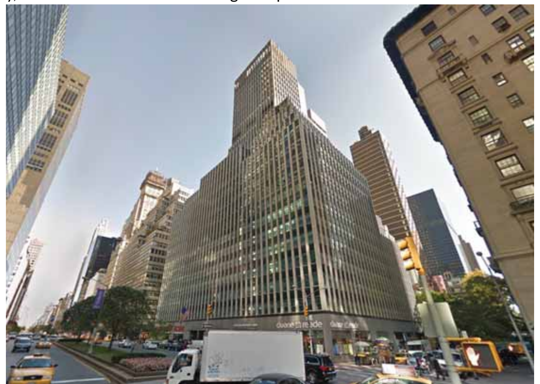
425 Park Avenue in October of 2014.

425 Park Avenue is one of Manhattan's most interesting redevelopment projects. Work there is humming along, and today, YIMBY has some new renderings and photos of the construction.