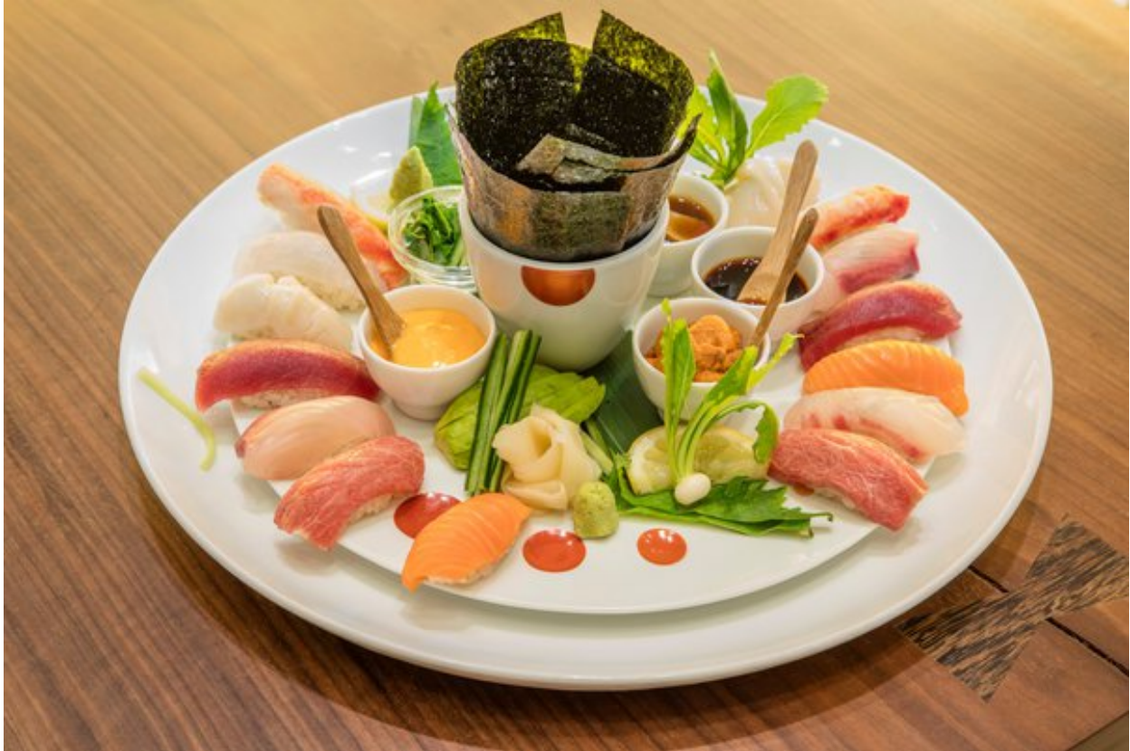
The new restaurant's vast dinner menu reprises some of Nobuyuki Matsuhisa's greatest hits.

Downstairs, the 152-seat main dining room (about twice the size of the old restaurant and about the size of the dining room at Nobu57 in Midtown) has an undulating ceiling of pale wooden slats. An open kitchen takes up one end, with a sushi bar in front of it. The original Nobu is recalled with walls faced in dark river stones and several angular tree sculptures. Unlike the old place, this one has private dining areas.