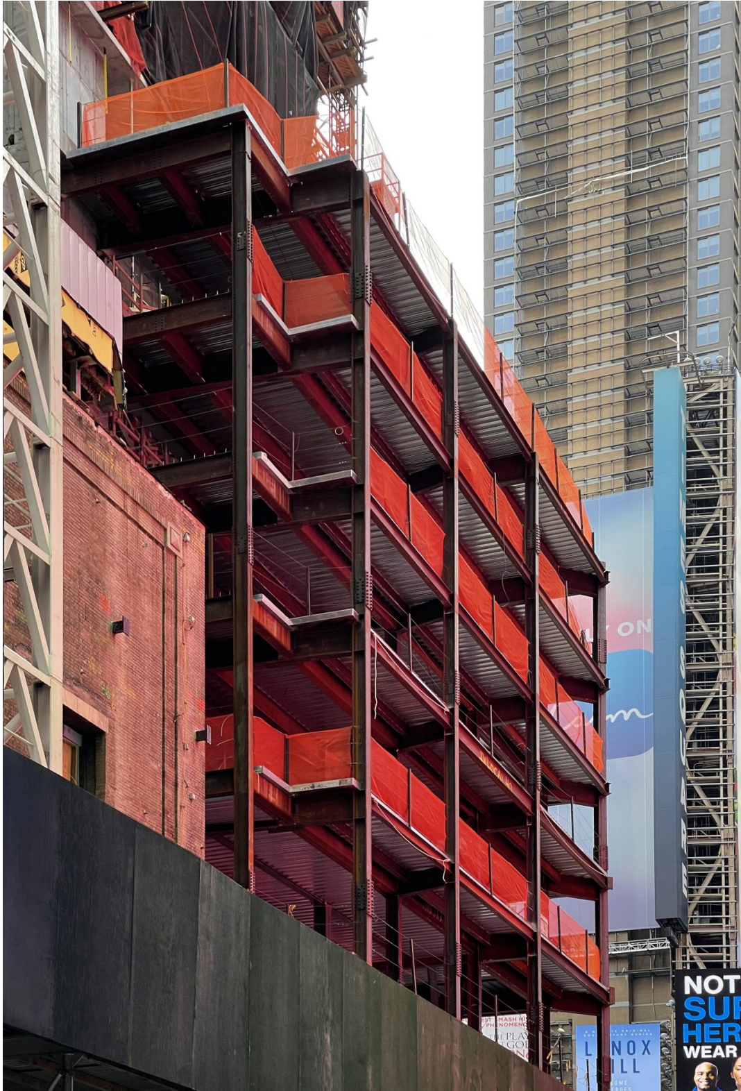
The construction crane is positioned on the northern side with its tower sitting directly next to the brick walls of the Palace Theater. The mechanical hoist faces Seventh Avenue.