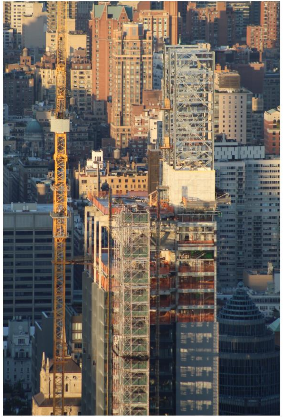
425 Park Avenue.

Photos from across the city show that the temporary steel braces that went in between the fins have also been recently dismantled, making the fins appear more prominent.