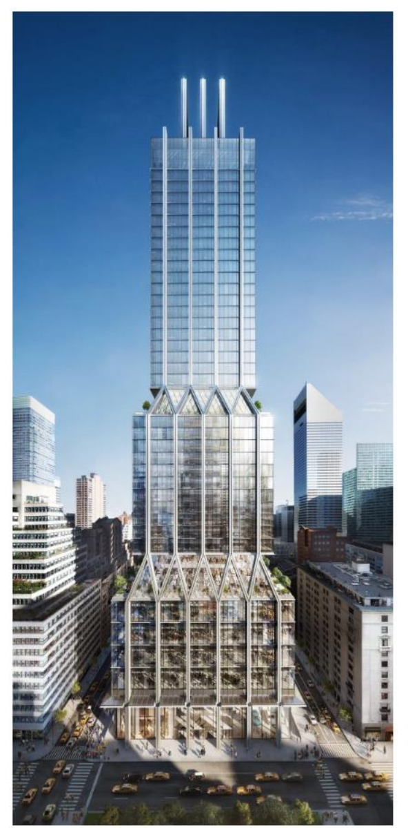
425 Park Avenue. Rendering by Dbox, courtesy of Foster + Partners

Structural Framework Finished For 425 Park Avenue's Parapet Fins, In Midtown East