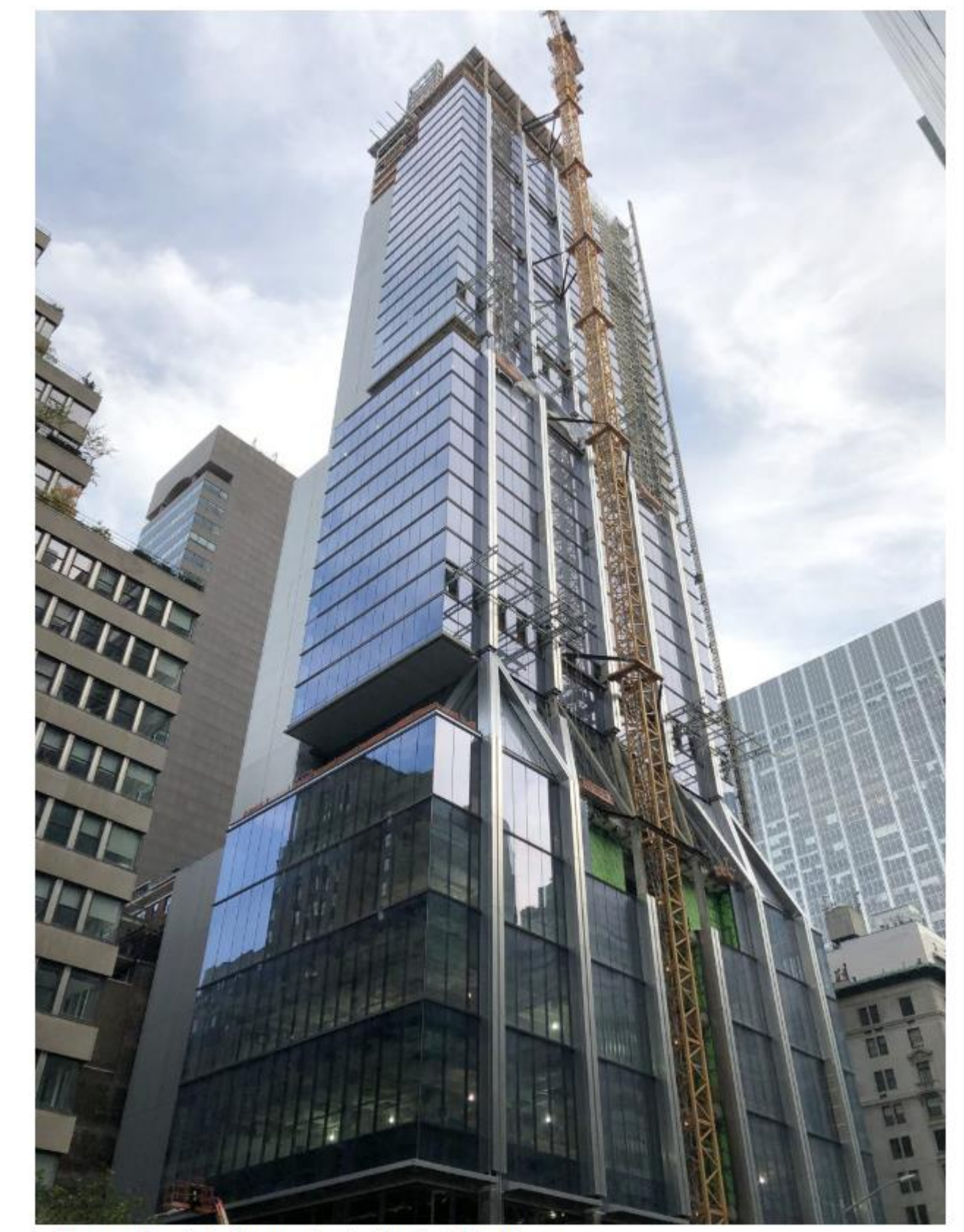
Looking up at the main Park Avenue elevation.

Meanwhile, the glass curtain wall that makes up the large western elevation facing Park Avenue closes in on the final floors of the third and largest building tier.