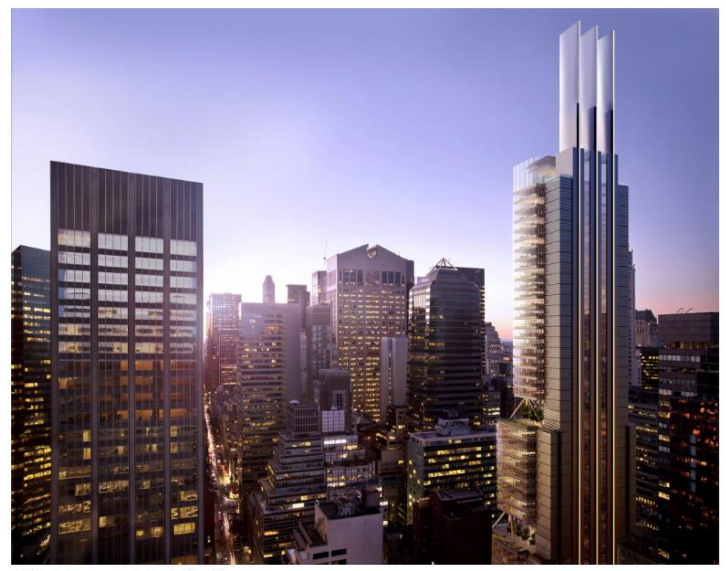
425 Park Avenue, rendering by Visualhouse

425 Park Avenue is expected to be finished by the end of 2020.