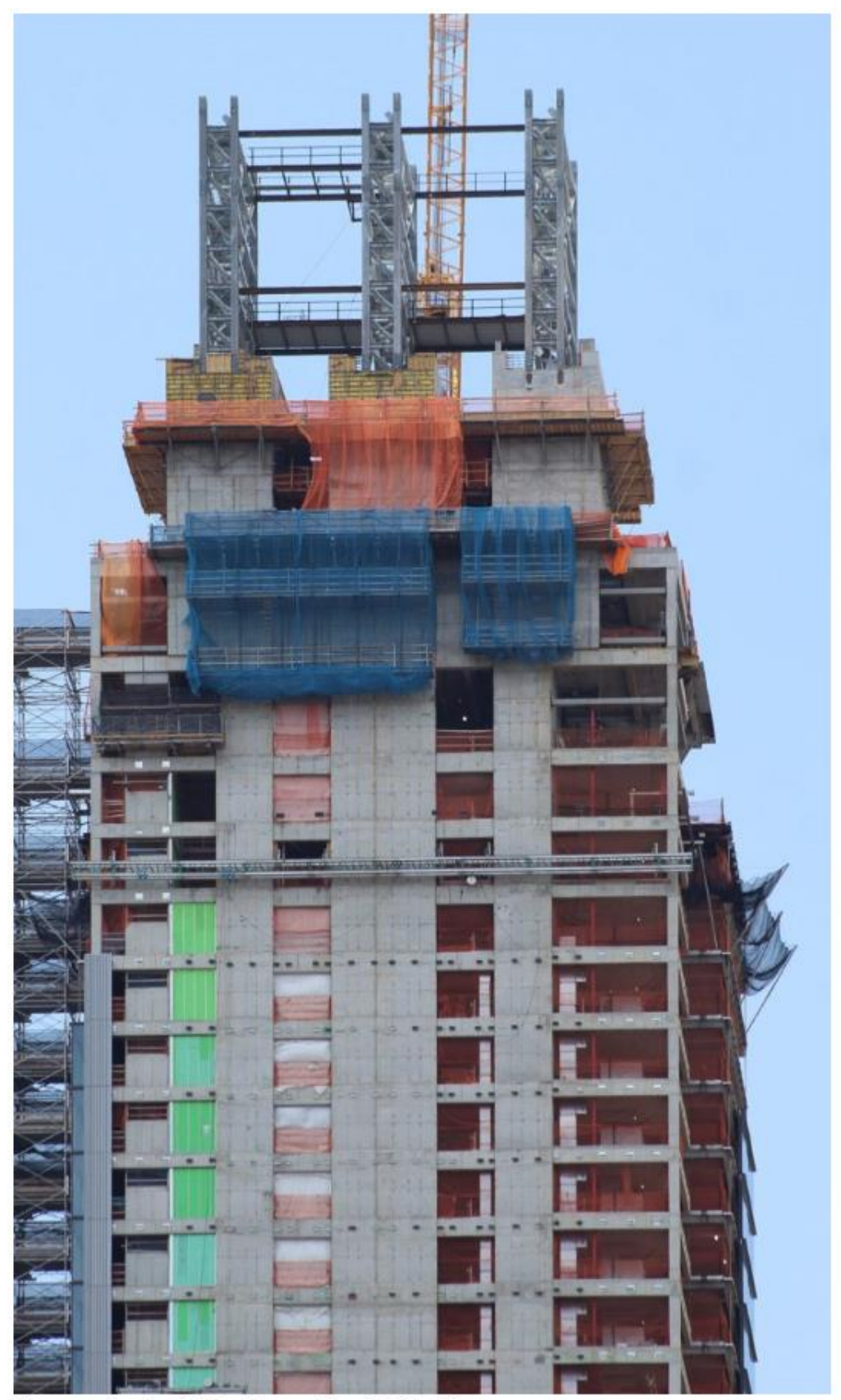
The eastern elevation of 425 Park Avenue.

The photo below from the past summer shows what the fins looked like with the bracing, and before they were fully topped. Showing the same elevation, the rendering below depicts what the final product will look like at night. Each fin will be illuminated and create a distinct crown above the Midtown skyline.