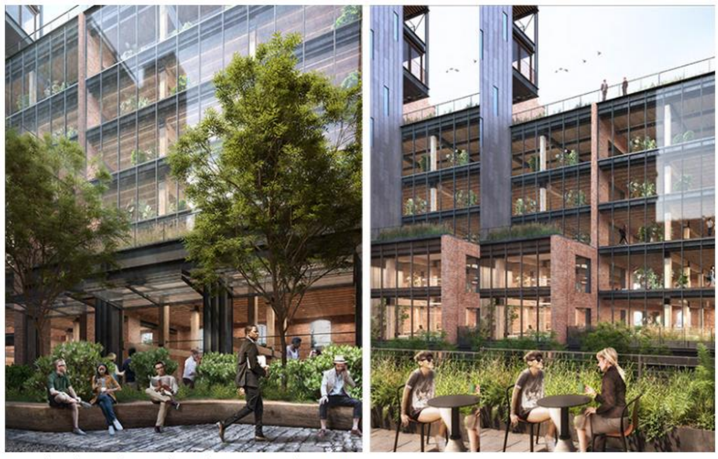
Revised rendering of Terminal Warehouse courtyard – COOKFOX