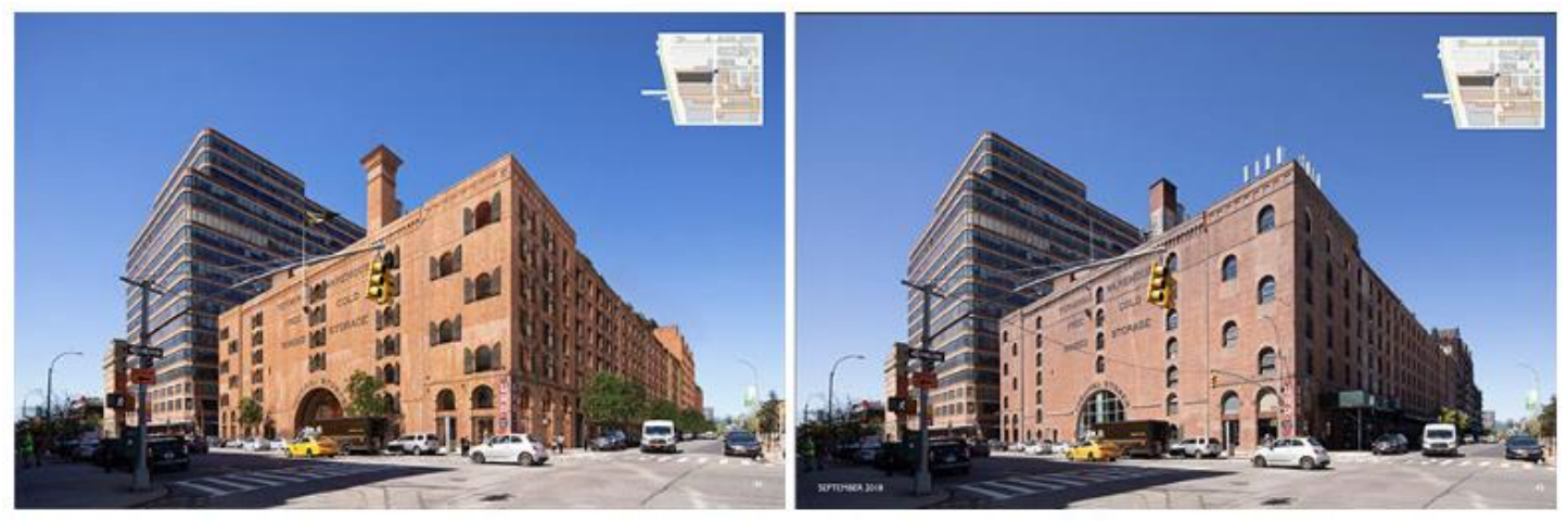
Revised rendering of Terminal Warehouse window systems (left) versus originally designed windows (right) - COOKFOX