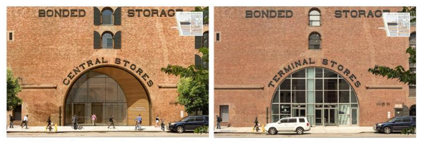
Revised rendering of Terminal Warehouse entryway (left) versus originally designed entrances (right) - COOKFOX