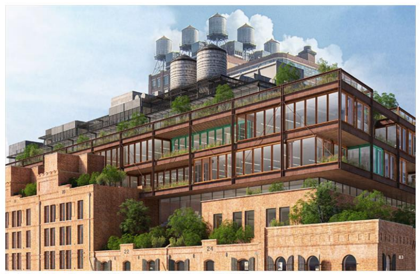
Revised rendering of vertical addition at Terminal Warehouse – COOKFOX