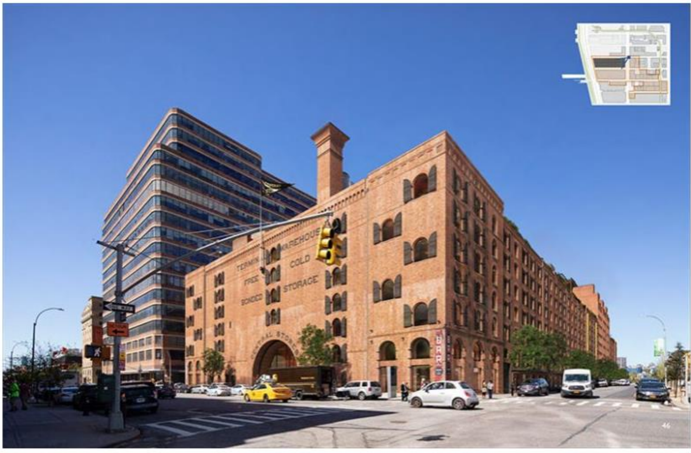
Rendering of Terminal Warehouse - COOKFOX

Proposal For Terminal Warehouse Renovations Returns To The Landmarks Preservation Commission