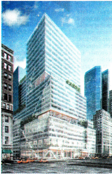
390 Madison Avenue