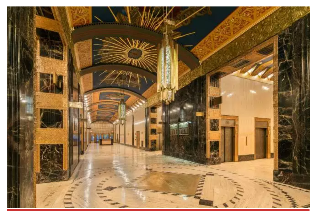
The Verizon building in Tribeca is now a condo with a glittering lobby (above) called 100 Barclay that still houses the telecom giant's offices.

Magnum had to craft doors from what were once windows to make terraces accessible to residents. The company also installed an entirely new lobby that is separate from the building's 140 West St. entrance for Verizon workers.