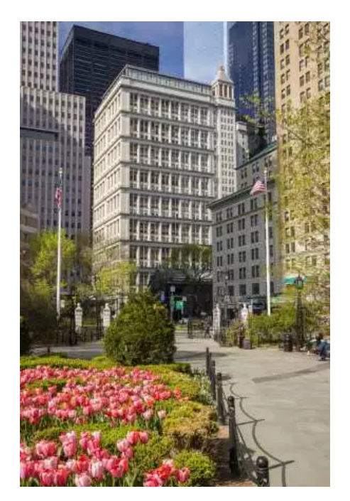
L&L carefully renovated neoclassical 195 Broadway to Include glass-walled stores. Alan Schindler

During excavation work, his crew found a glass cream bottle, labeled Sheffield Farms, some 70 feet below the surface. It was a major dairy and milk supplier to the city during the first half of the 20th century.