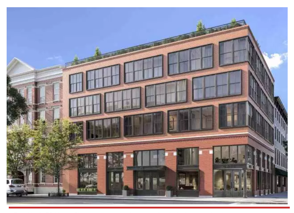
Brooklyn's 70 Henry St. Is another mixed-use overhaul of a historic structure. Mettle Property Group

For every historic building, developers also go to the ends of the Earth to seek out the original factories and skilled craftsmen to ensure all new details perfectly match to the old.