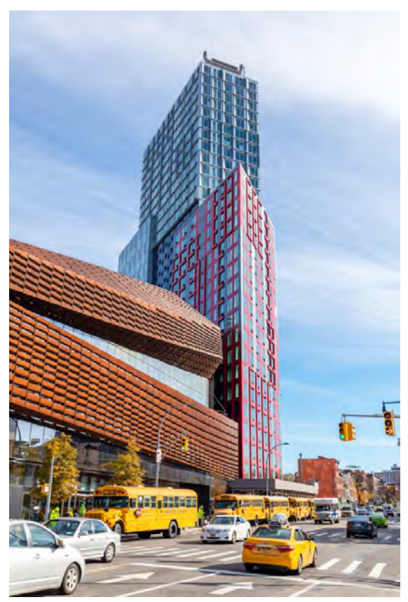
Pacific Park's first completed residential building, 461 Dean, formerly known as B2.

Evidently Pacific Park's crowning element could be substantially taller, and the rendering would seem to indicate a height around the 800-foot mark. While that would make it the tallest tower in the borough if completed today, by the time of full build-out, in approximately 2025-2030, there should be several buildings of that height or greater.