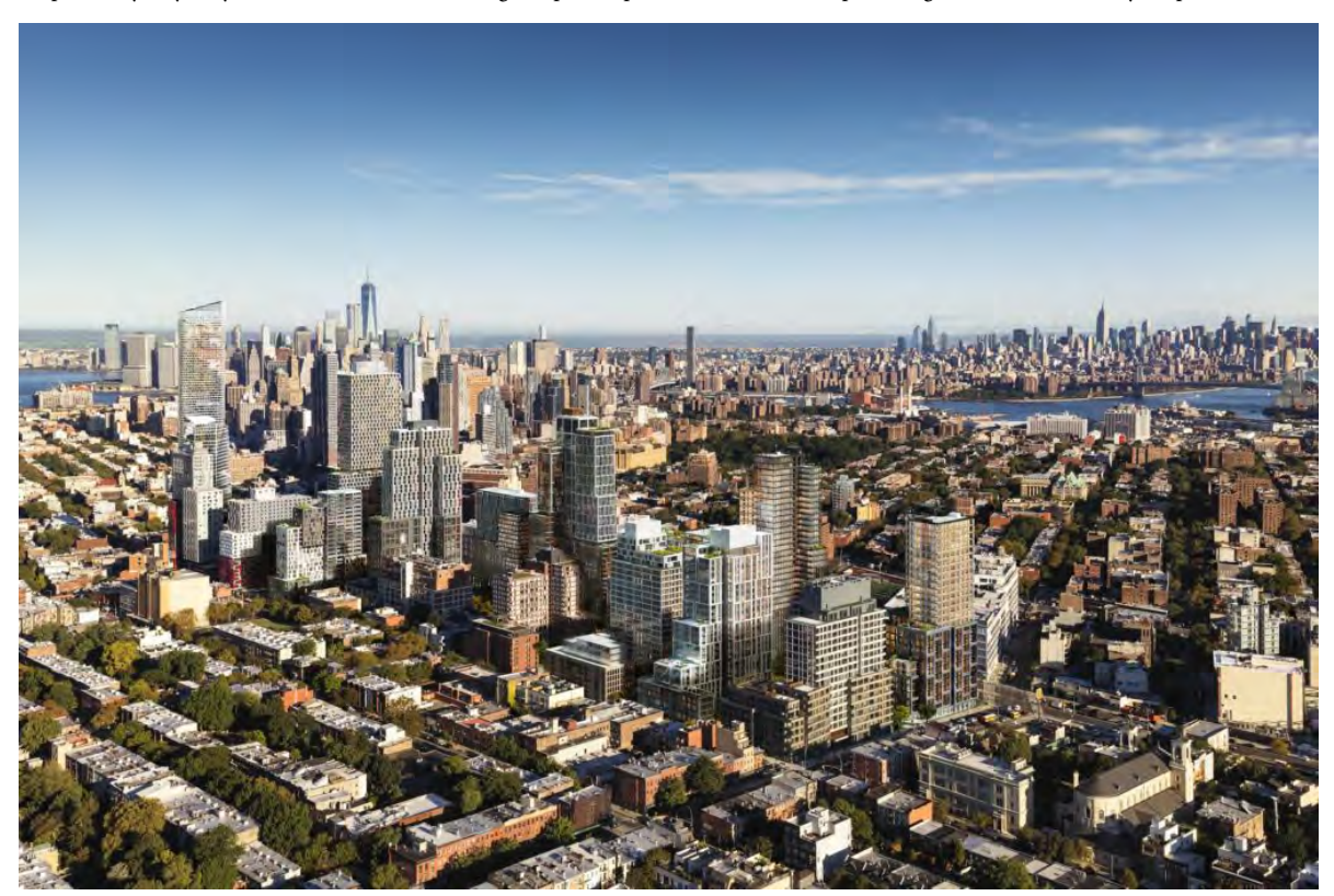
Pacific Park Aerial, image by VUW Studio

https://newyorkyimby.com/2018/01/new-rendering-for-pacific-parks-full-build-out-depicts-neighborhoods-tallest-skyscraper.html