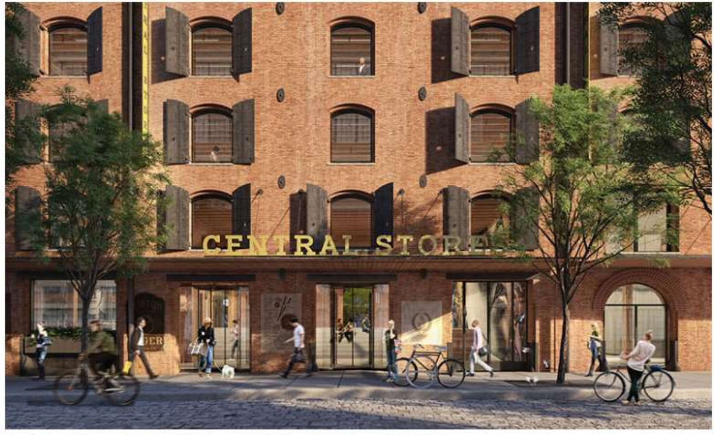
Rendering of the new terminal Warehouse in Chelsea, Manhattan (COOKFOX)