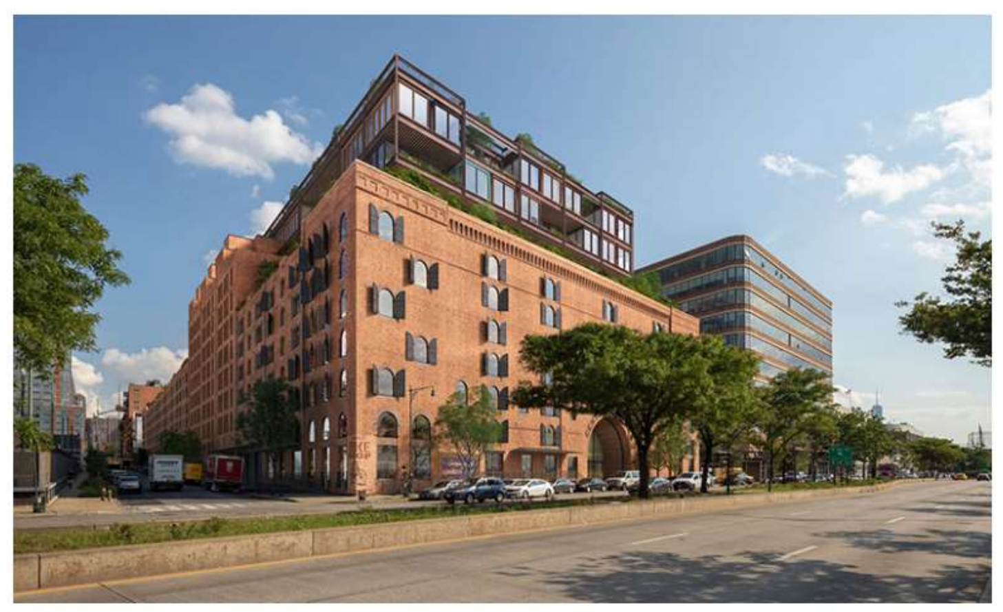
Rendering of the new terminal Warehouse in Chelsea, Manhattan (COOKFOX)