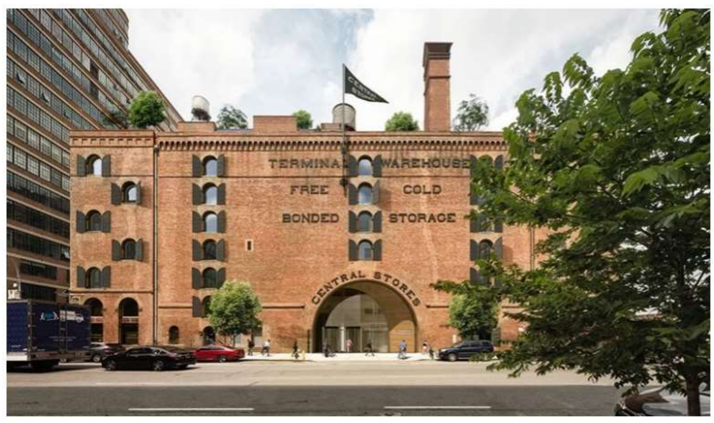
Rendering of the new terminal Warehouse in Chelsea, Manhattan (COOKFOX)