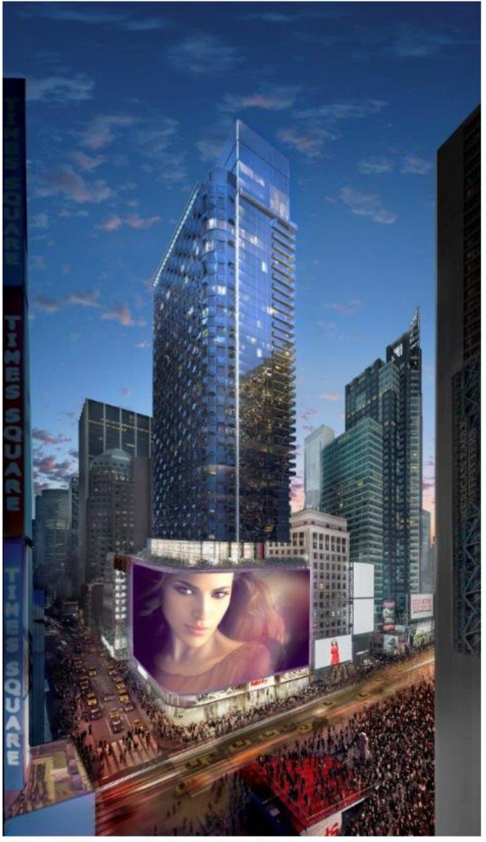
Rendering of the planned 1568 Broadway development (L&L)