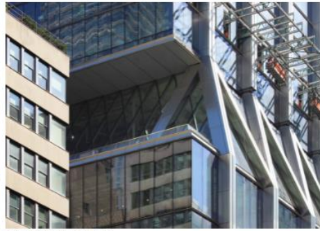
425 Park Avenue.