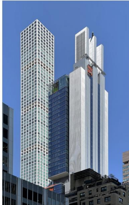
425 Park Avenue.

The afternoon sunlight brightly reflects off the metal and glass panels and highlight the sleek geometric lines around the sloped columns and setbacks. The crane and exterior hoist have been fully disassembled, and only a few of the floor-to-ceiling panes of glass await installation.