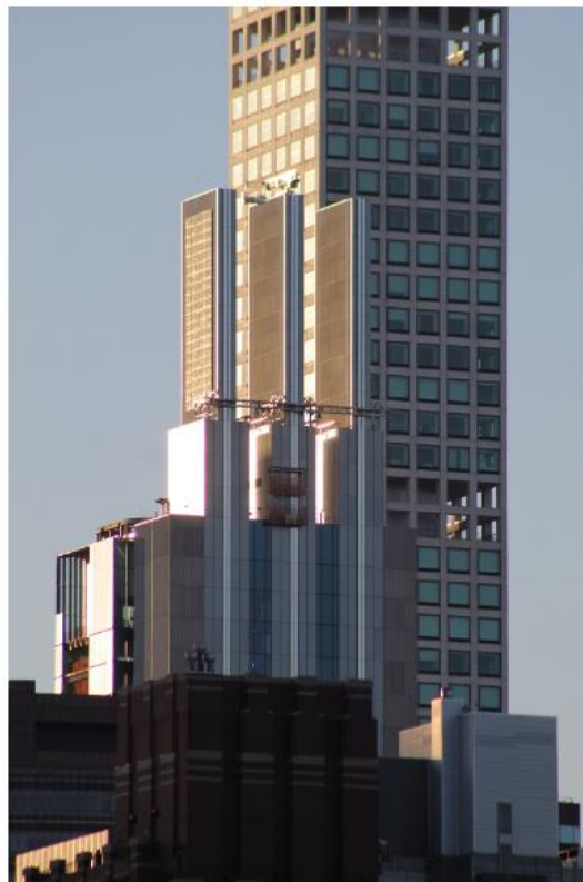
425 Park Avenue.

At sunset the three fins warmly glow over Midtown, and LED arrays on their outer surfaces have begun to be illuminated at night.