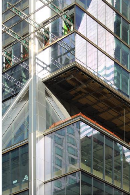
425 Park Avenue.