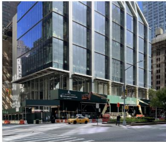
425 Park Avenue.

The building features a 45-foot-tall lobby with stone flooring, interior glass walls, and state-of-the-art elevator systems. These lower floors are still obscured with sidewalk scaffolding and construction boards, but these will likely be disassembled in the coming months.