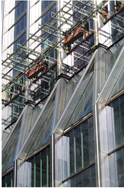
425 Park Avenue.