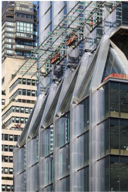
425 Park Avenue.