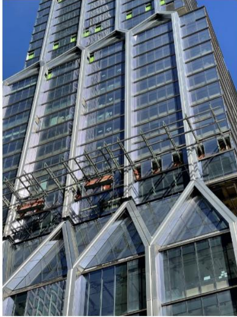
425 Park Avenue.