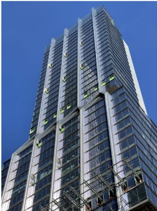
425 Park Avenue.

The afternoon sunlight brightly reflects off the metal and glass panels and highlight the sleek geometric lines around the sloped columns and setbacks. The crane and exterior hoist have been fully disassembled, and only a few of the floor-to-ceiling panes of glass await installation.