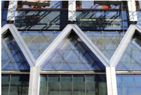
425 Park Avenue.