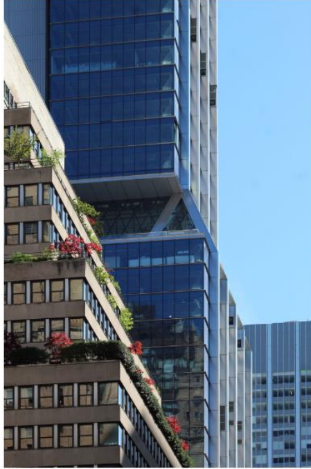
425 Park Avenue.

At sunset the three fins warmly glow over Midtown, and LED arrays on their outer surfaces have begun to be illuminated at night.