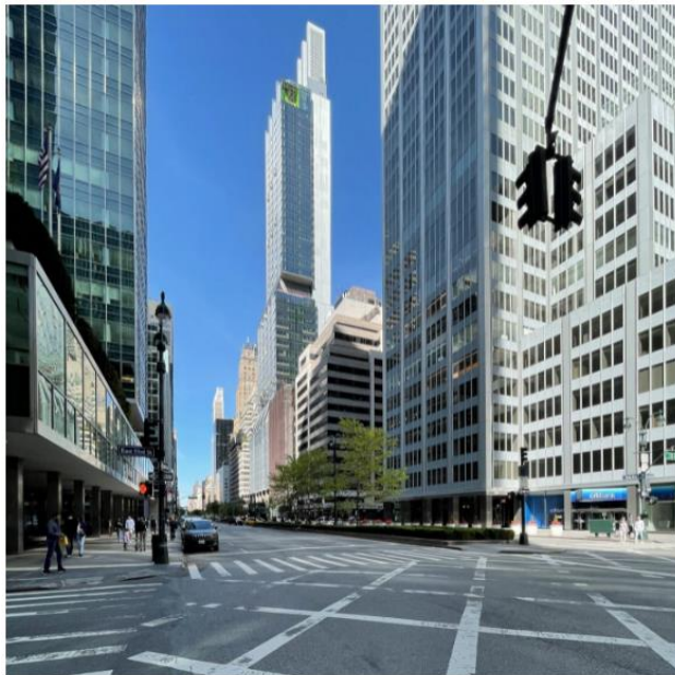
425 Park Avenue.