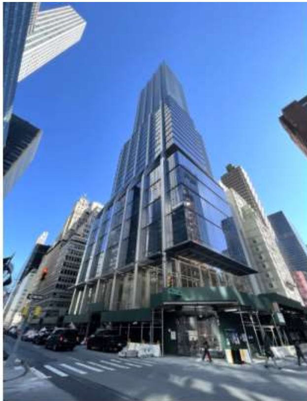
425 Park Avenue.

Finishing touches have continued since our last update in December, including work on the canopy above the main entrance. The sidewalk scaffolding should be taken down in the coming weeks as construction above reaches full completion.