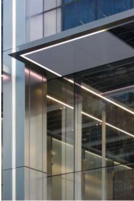
421 Park Avenue