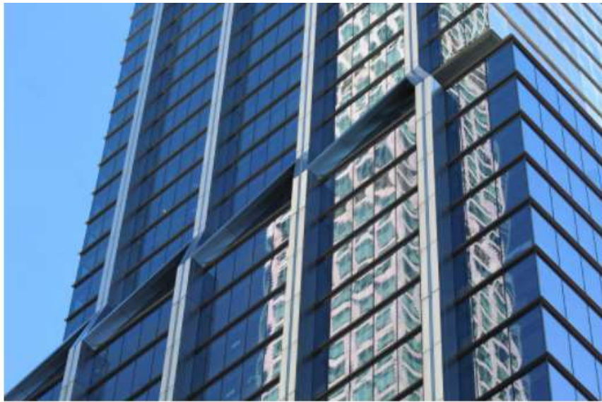
425 Park Avenue.