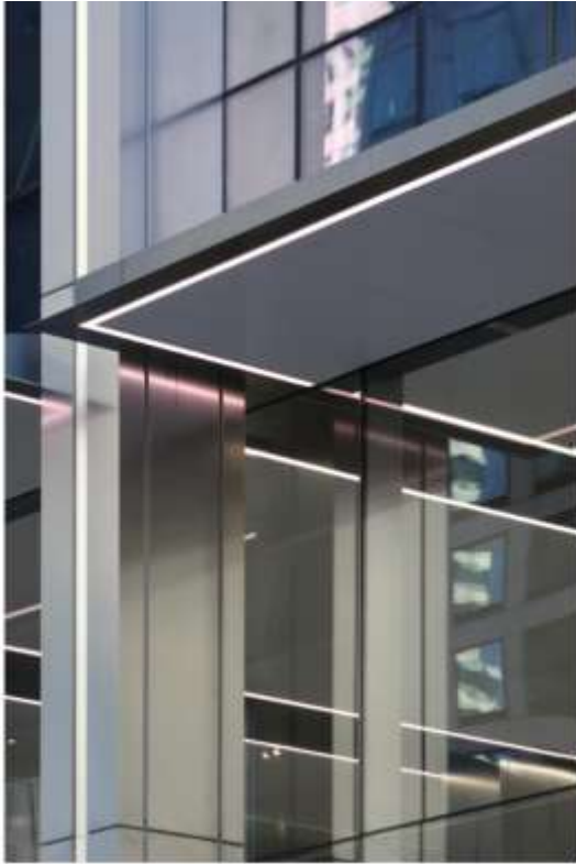
421 Park Avenue