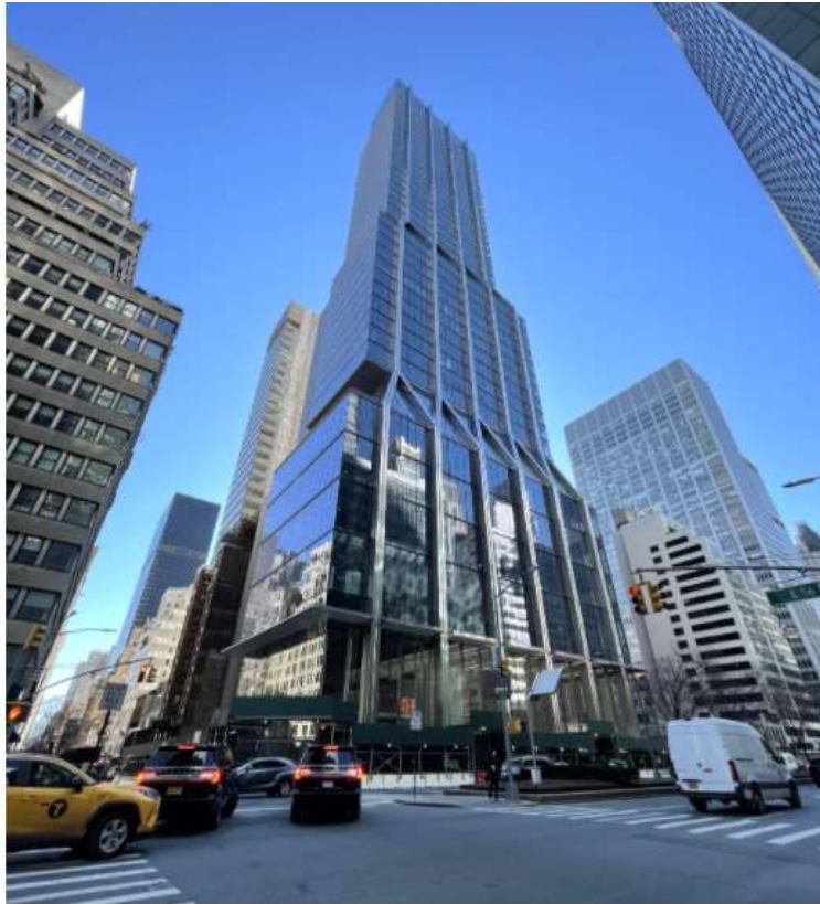
425 Park Avenue.