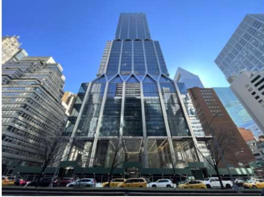
425 Park Avenue.