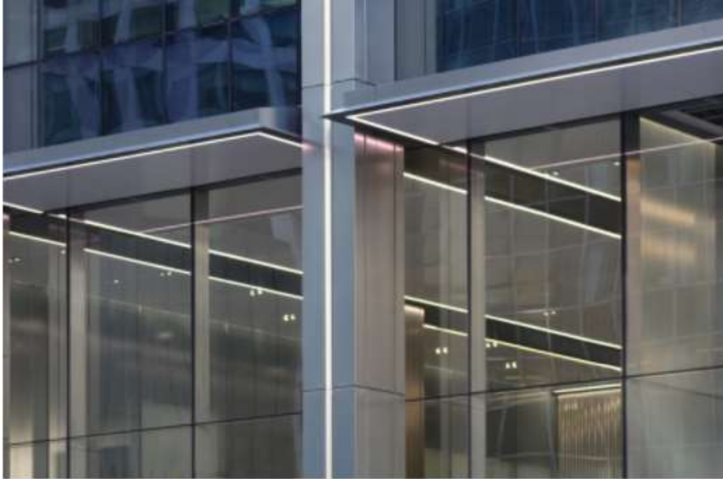
425 Park Avenue.

The three signature fins that crown the top of 425 Park Avenue continue to illuminate at night in various color schemes and patterns, including blue and yellow in solidarity for Ukraine.