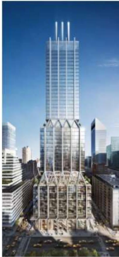
425 Park Avenue Rendering by Olson, courtesy of Foster + Partners