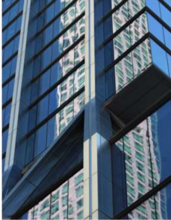
423 Park Avenue.