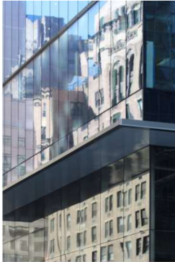
425 Park Avenue.