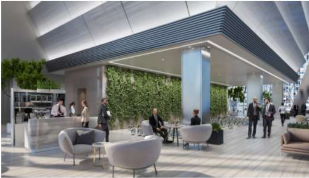
The Diagrid Club. Rendering from the main website of 425 Park Avenue

425 Park Avenue’s tenant list includes Citadel Enterprises, which plans to occupy 331,800 square feet spread across 16 full floors, encompassing the penthouse office floor, mezzanine, and one of the three-story diagrid-framed floors at the setbacks. High above Park Avenue is “The Diagrid Club,” a retreat for office workers with hospitality by both Daniel Humm and Make It Nice featuring an avant-garde sculpture by Japanese contemporary artist Yayoi Kusama, called “Narcissus Garden,” which can be seen below the green wall in the rendering below. There will also be meditation spaces and a dining area.