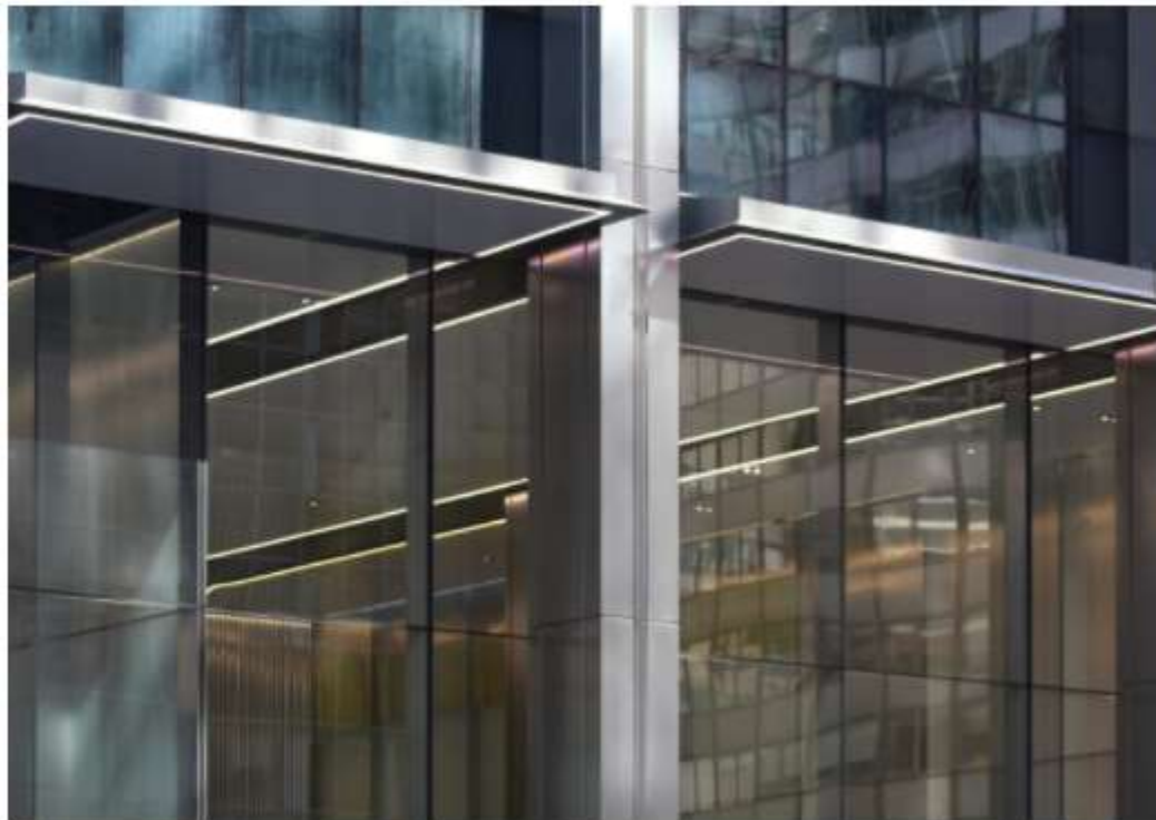
425 Park Avenue.