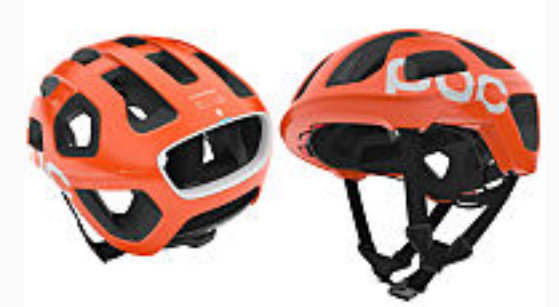
Volvo Created the Next Step in Bicycle Safety Bloomberg Businessweek

COOKING TIPS: Chopping An Onion Food Should Taste Good