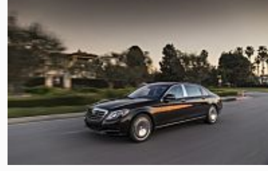
2016 Mercedes-Maybach S600 First Drive Motortrend