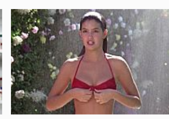
15 Things You Probably Didn't Know About Fast Times at Ridgemont... IFC