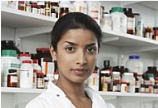
Million in HIPAA Professional... Insureon