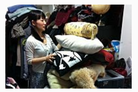
How To Organize Your Apartment Pharmacist Found Liable for $1.44 Once In 2015 (And Never Again) Makespace